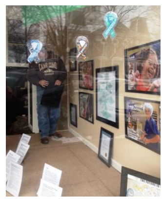
2013 History of DD display

Proclamations were signed in all Howard County towns to recognize this event.