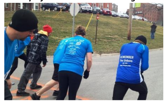
And the race is on!

Thanks to our participants and sponsors we were able to raise over $1300 and educate people about developmental disabilities.